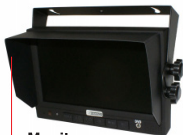
Monitor With brackets and mounts